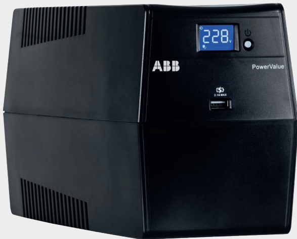
ABB presents a superior uninterruptible power supply (UPS) that benefits from the technology, engineering and quality inherent in ABB's high-end UPS products.

A high-quality desktop line-interactive UPS to suit all pockets